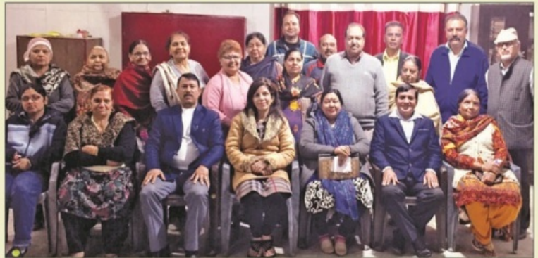
MS West Zone Monthly Meeting on 3 Feb 2019