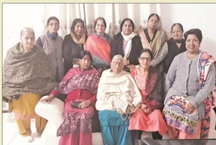
MS Yamuna Nagar Istri Wing, Monthly Meeting on 5 Feb 2019