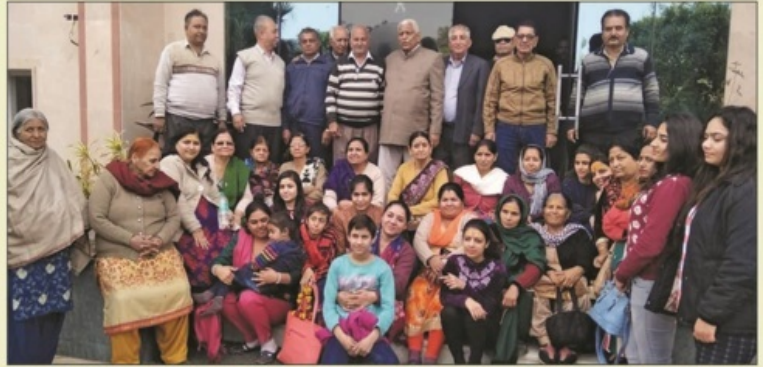
MS Faridabad organised trip to Mathura - Vrindavan on 27 Jan 2019