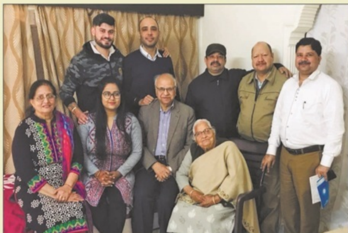
MS Ashok Vihar Monthly Meeting on 10 Feb 2019