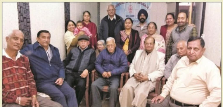
MS Mohali Monthly Meeting on 10 Feb 2019