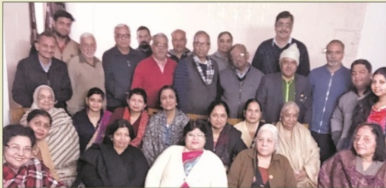
MS Ghaziabad Monthly Meeting on 27 Jan 2019