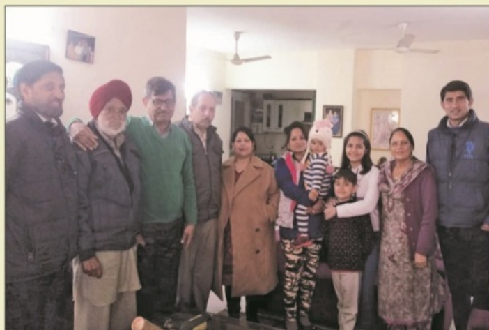
MS Prem Nagar Dehradun Monthly Meeting on 27 Jan 2019