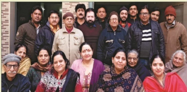
MS Yamuna Paar Monthly Meeting on 3 Feb 2019