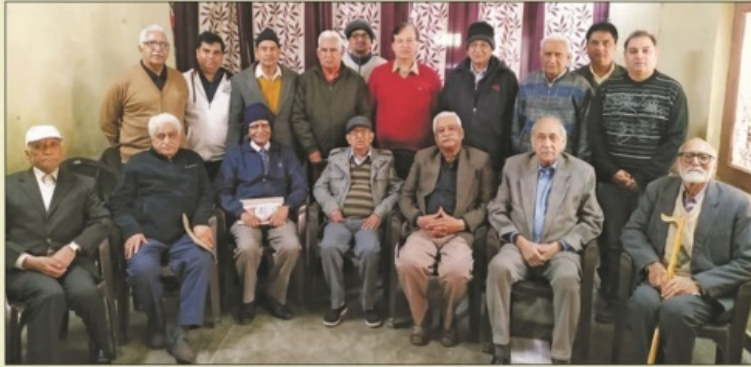
MS Gurgaon Monthly Meeting on 3 Feb 2019