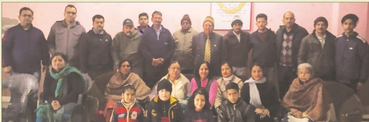
MS Ambala City Monthly Meeting on 3 Feb 2019