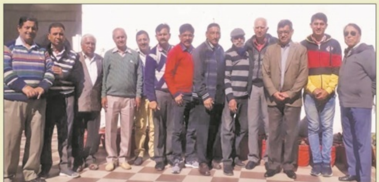
MS Dehradun Monthly Meeting on 3 Feb 2019