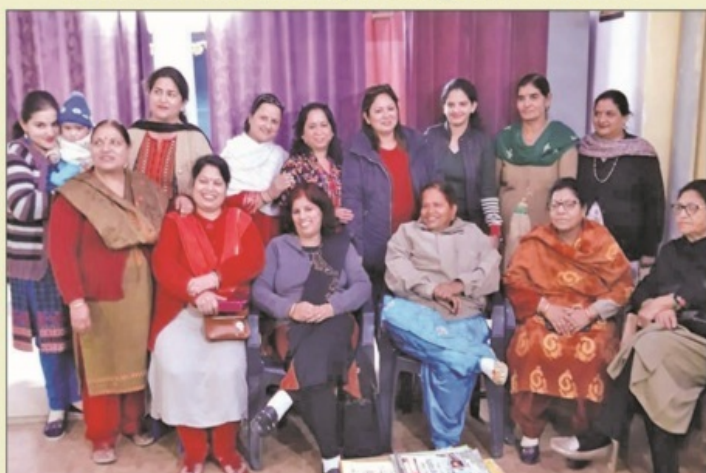
MS Dehradun Istri Wing, Monthly Meeting on 6 Jan 2019