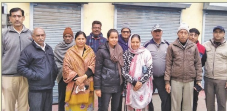
MS Jagadhri Workshop Monthly Meeting on 3 Feb 2019